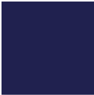
Azul RAL 5002