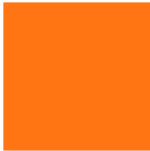
Naranja RAL 2003