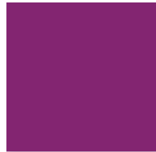
Rosa RAL 4006