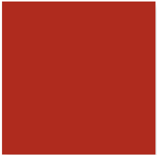
Rojo RAL 3000